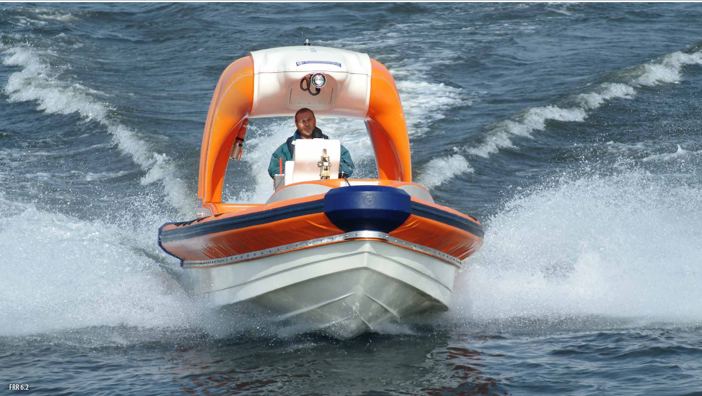
FRR 6.2 exzellent steering performance