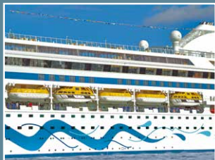
Cruise & Ferry