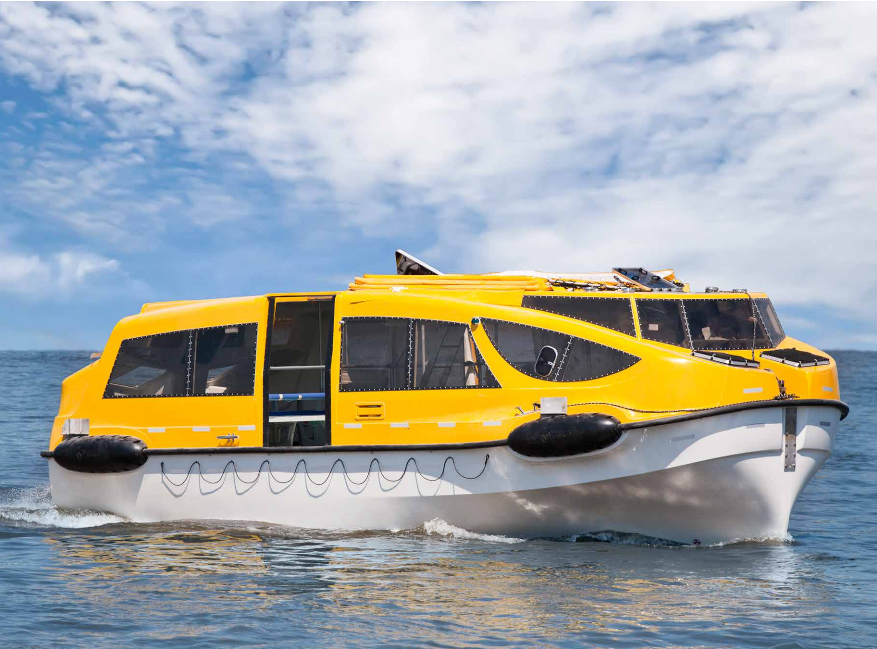
PLL 1099 Evo – 170 persons lifeboat capacity